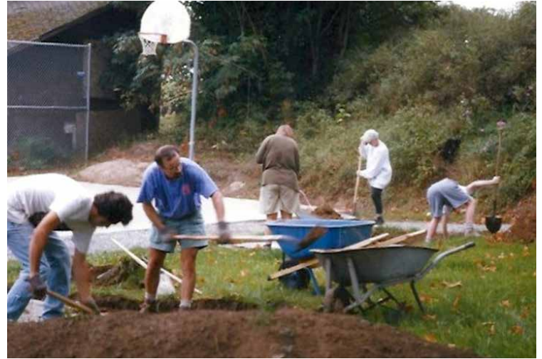
Volunteers spread dirt for the butterfly/perennial garden bed and prepare memorial bench area, circa early 1990s.

Rock Hill Park is between the Humboldt/Iron alley and I-5 just north of Lakeway Drive.