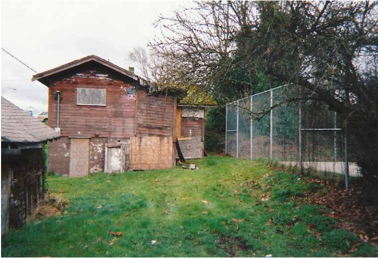
The abandoned house sat next to the park for many years until finally, following a suspicious fire, the owner was required to demolish it. In 2008 the City purchased the lot and added it to the park.

In the late 1970s this open-space parcel of four-plus lots was slated to become a multiunit apartment complex, but with federal block grant funds the land was purchased for $35,000. York Neighborhood Association took over maintenance of the area, and thus Rock Hill Park was born. Over the next 20 years, York volunteers oversaw many projects: regrading and seeding the upper open-space area, clearing out brambles and blackberries, and creating access to the large sandstone rock for climbing and a good spot to view Mount Baker. They also built the staircase to connect to the lower level and installed the basketball court and the perennial garden berm along the alley with flowering plants for a butterfly habitat. In 2005 the local Boy Scout Troop installed the stone wall circling the butterfly garden. Many of these projects were funded by the City's "Small and Simple" Grant awards from the Mayor's Office.